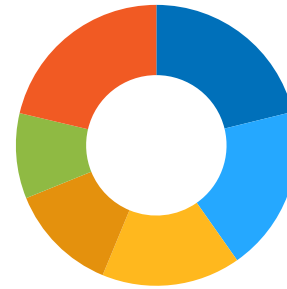
SHORT POSITIONS AS OF 01/14/2026